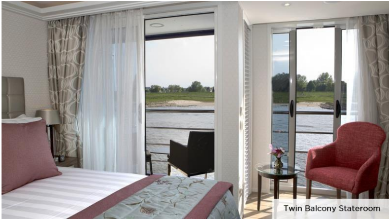
Twin Balcony Stateroom

7-night cruise | September 3-10, 2025 | Aboard AmaSonata