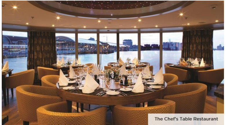
The Chef's Table Restaurant