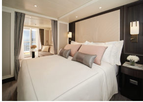
DELUXE VERANDA SUITE